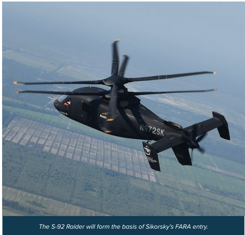
The S-92 Raider will form the basis of Sikorsky's FARA entry.

competitor on FARA, and relies on Sikorsky's compound helicopter technology. So Boeing will have to come up with a different design for FARA.