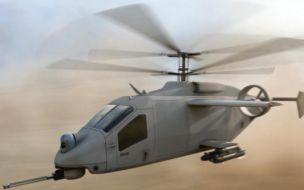
The AVX Aircraft Company/L3Harris FARA concept features a compound coaxial design with dual ducted fans for forward and reverse thrust.