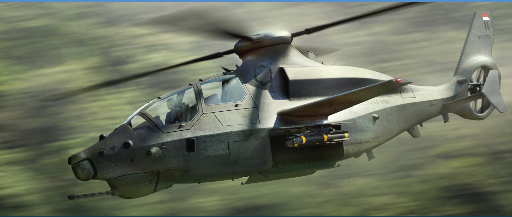
Bell 360 Invictus will reduce costs by incorporating systems like the rotor system from Bell's 525 Relentless.

Command Aviation & Missile Center public affairs. “We only make awards based on their progress as observed by the government. There are defined milestones. If those milestones are hit early and the government is satisfied with those milestones, the program can proceed quicker than what was anticipated.”